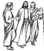
On the Road to Emmaus

The simple gesture of breaking bread with the two disciples opens their eyes to the risen Christ. Isn't this what we do each and every time we gather to celebrate Mass? Do we see the wondrous life of Jesus come alive as the Gospel is proclaimed? Should not our hearts be on fire as we prepare to receive Jesus' body and blood? Should not our response to the gift be a firm "amen?"